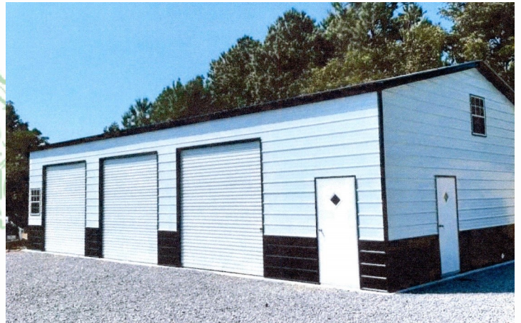
Proposed Walltown Food Ministries Building

In the near future, the Walltown Board will meet to finalize details in order to move the project to its next phase towards completion. The cost to establish the new home to centralize all functions of Walltown Food Ministries is approximately $80,000. So far, $35,000 has been donated towards that goal.