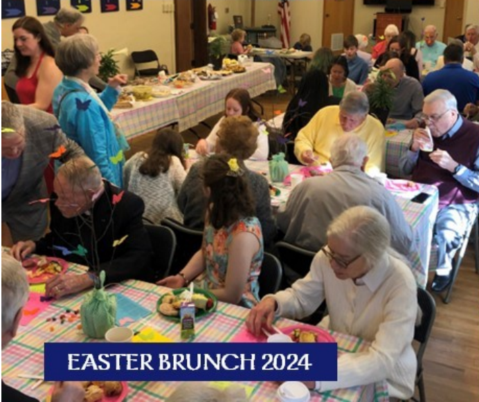
EASTER BRUNCH 2024